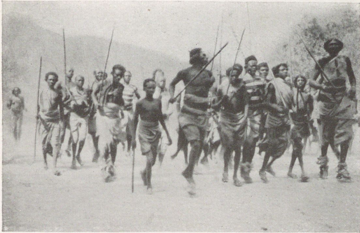
Cunamas kommen im Lauffschritt zum Tanz